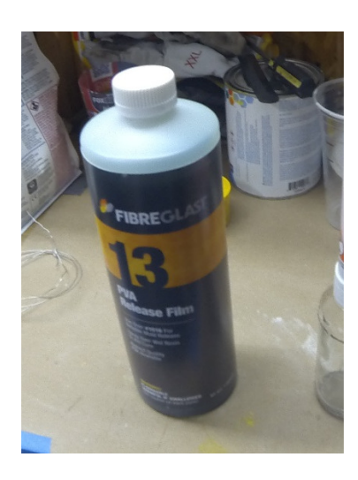
Parting Wax and Polyvinyl Alcohol (PVA)

Fibreglast sells PVA as well as a more expensive Fibrelease but I decided to go with the more traditional PVA. Fibreglast recommends spraying PVA but I found the brush easier to use and gives good results. At first take, this seems like it would leave brush lines but one feature of the PVA is it tendency to smooth out before it dries, leaving a smooth finish. The biggest problem I had with PVA was its tendency to run.