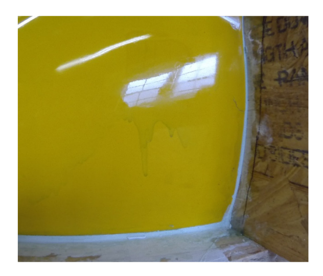
Runs Encountered on Plug Treated with PVA

Fibreglast sells PVA as well as a more expensive Fibrelease but I decided to go with the more traditional PVA. Fibreglast recommends spraying PVA but I found the brush easier to use and gives good results. At first take, this seems like it would leave brush lines but one feature of the PVA is it tendency to smooth out before it dries, leaving a smooth finish. The biggest problem I had with PVA was its tendency to run.