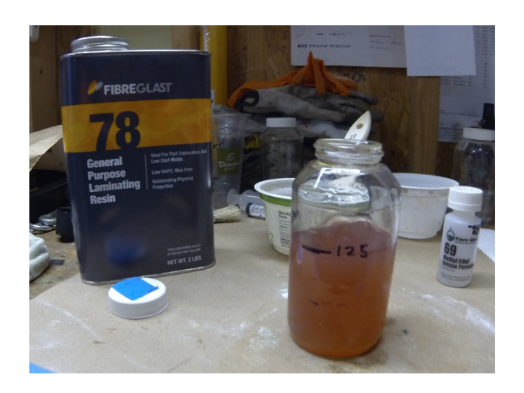
General Purpose Laminating Resin Measured Out

One question I had going in was "why both wax and PVA? Isn't just one good enough for releasing?" The answer came later when releasing the plug from the mold. PVA, while a good release agent, is actually somewhat adhesive. The wax makes it a lot easier to separate these two.