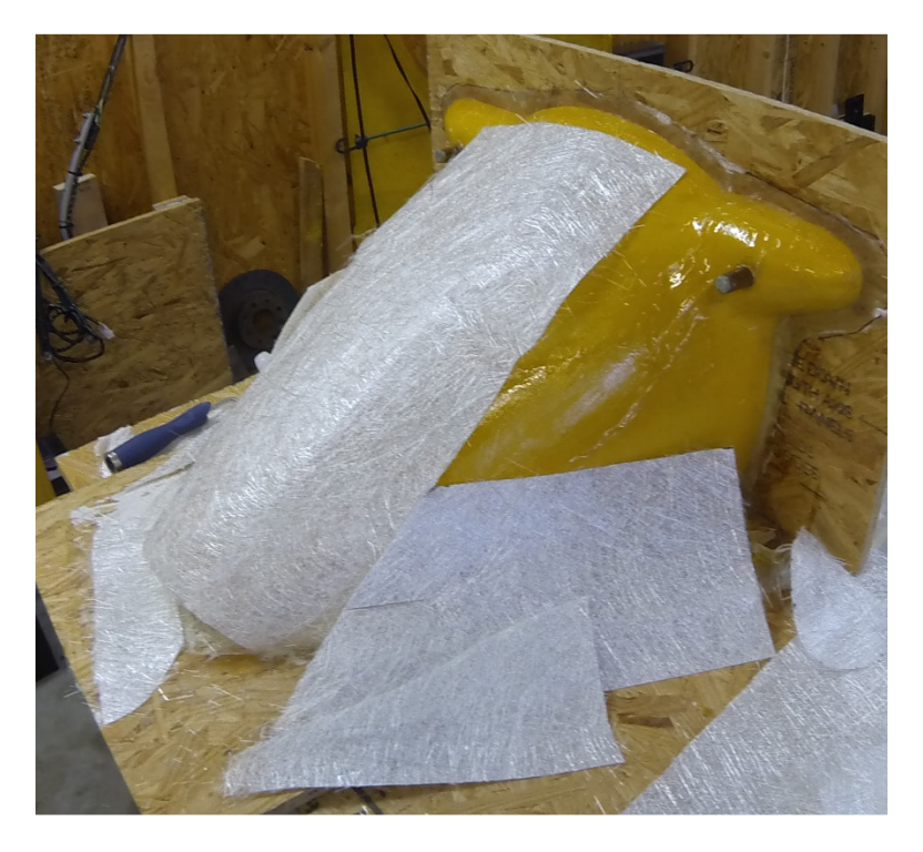
Plug with Various Pieces Layed out for Fitting

The first layer of fiberglass should be cloth (vs chopped fiber mat). My mistake was trying to do it with a single piece. Woven cloth is very good at covering curved surfaces but it does have limits. In retrospect I would have used 3 or 4 pieces of cloth. My attempt to use only one piece resulted in some nuisance wrinkles. These can trap air which can result in voids which can collapse to form dimples in the finished mold. If you get these, try extra hard to fill them with resin.