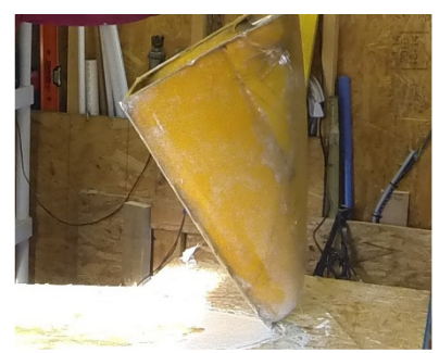
Removing the Fiberboard Base Plates