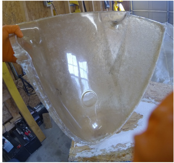
The Plug is Released from the Mold

With the mold released from the plug you can see how the surface came out. I can say I was very pleased with the results. The PVA created a mirror-smooth finish which transfered to the mold. This will make a super-smooth finish on the molded nose, saving me from a lot of finish work. I can't see any voids where the wrinkles were. The drips are visible if you really look. But those and any other flaws or voids can be fixed on the mold and while they will not have the same perfect mirror finish, they should not transfer the new nose if you use PVA release agent.